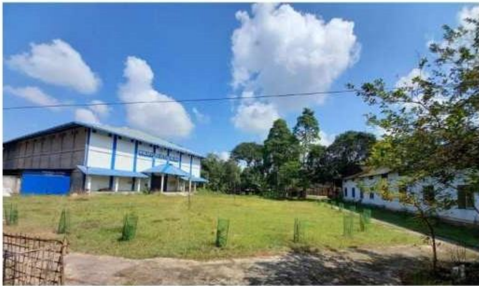
Indoor Stadium (14)