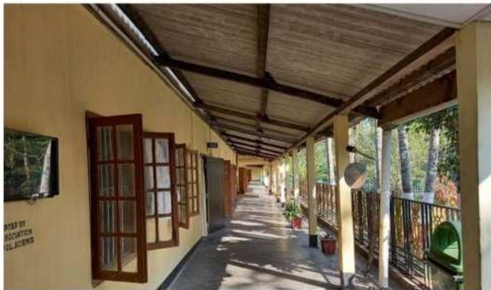
Old Arts Building (1)