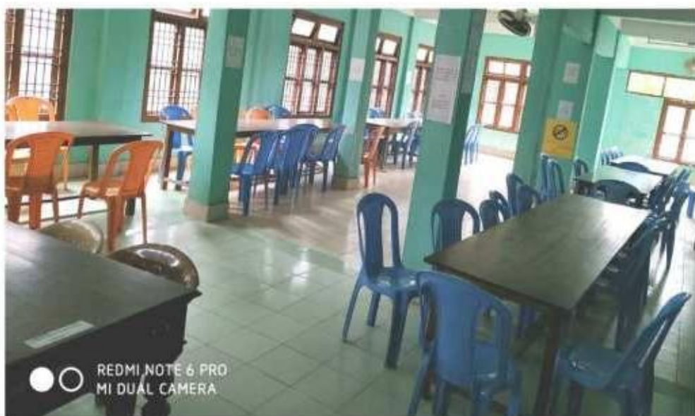
Central Library Reading Room