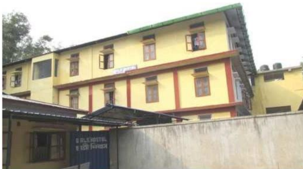
Girl's Hostel two Storied (12)