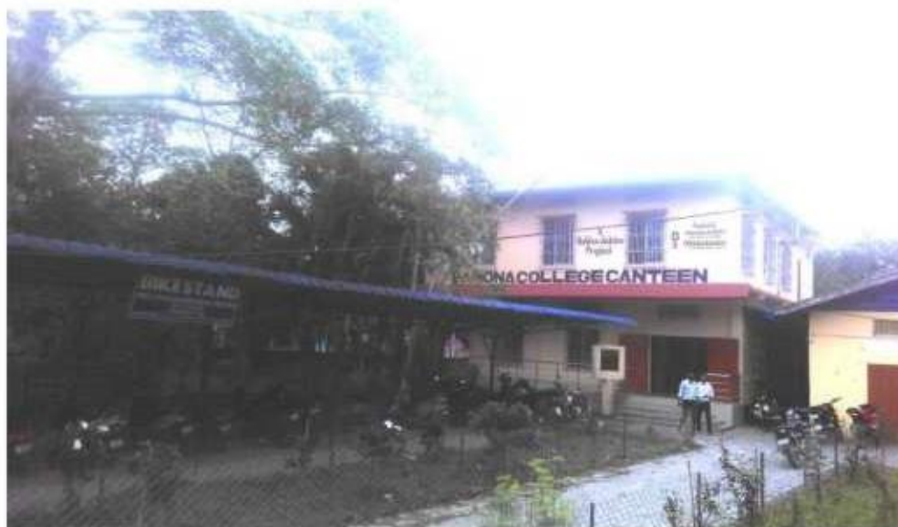
College Canteen (11)