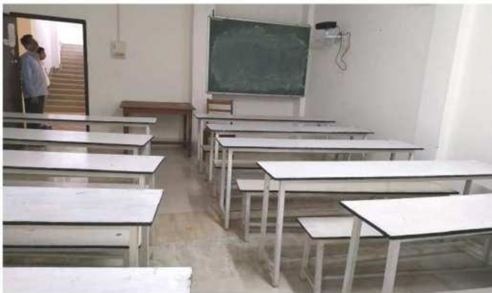
Proposed B.Ed Digital Class Room (ITEP-5)