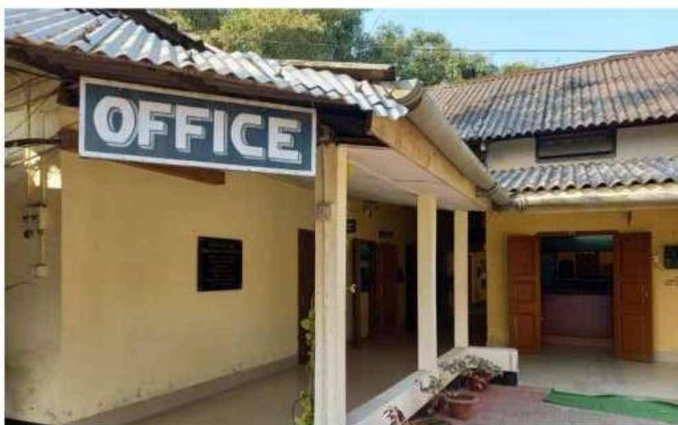
Office Building Assam Type