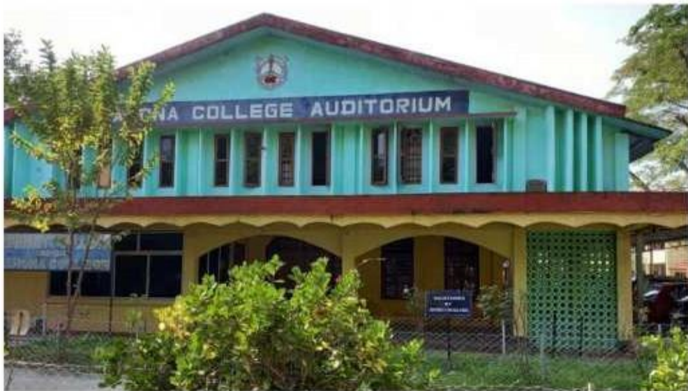
Auditorium cum Multipurpose Hall (8)