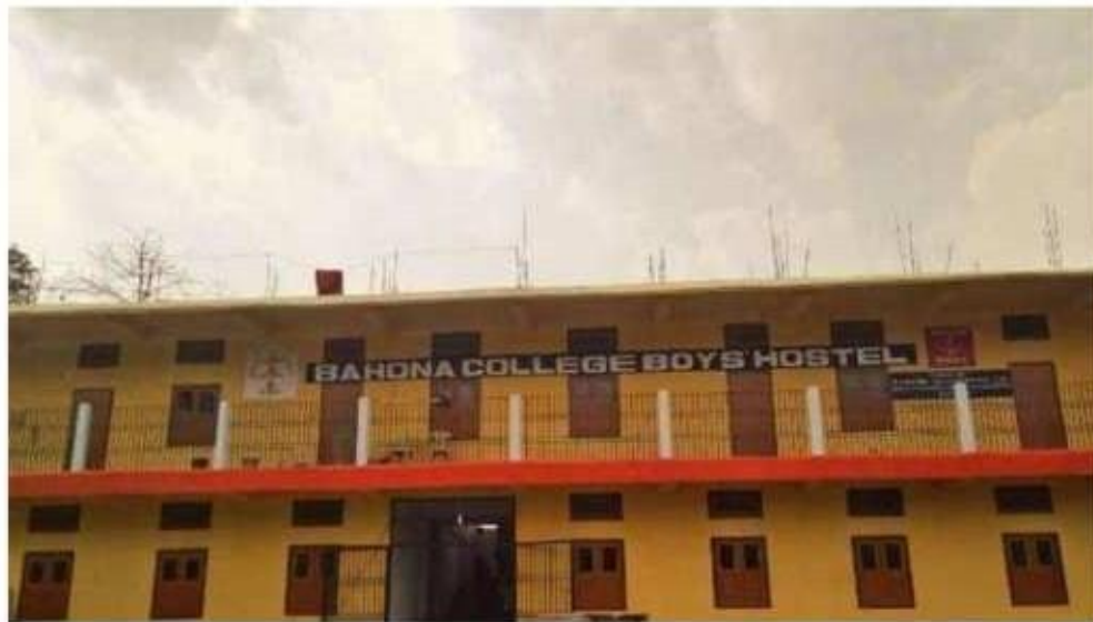
Boy's Hostel Two Storied (13)