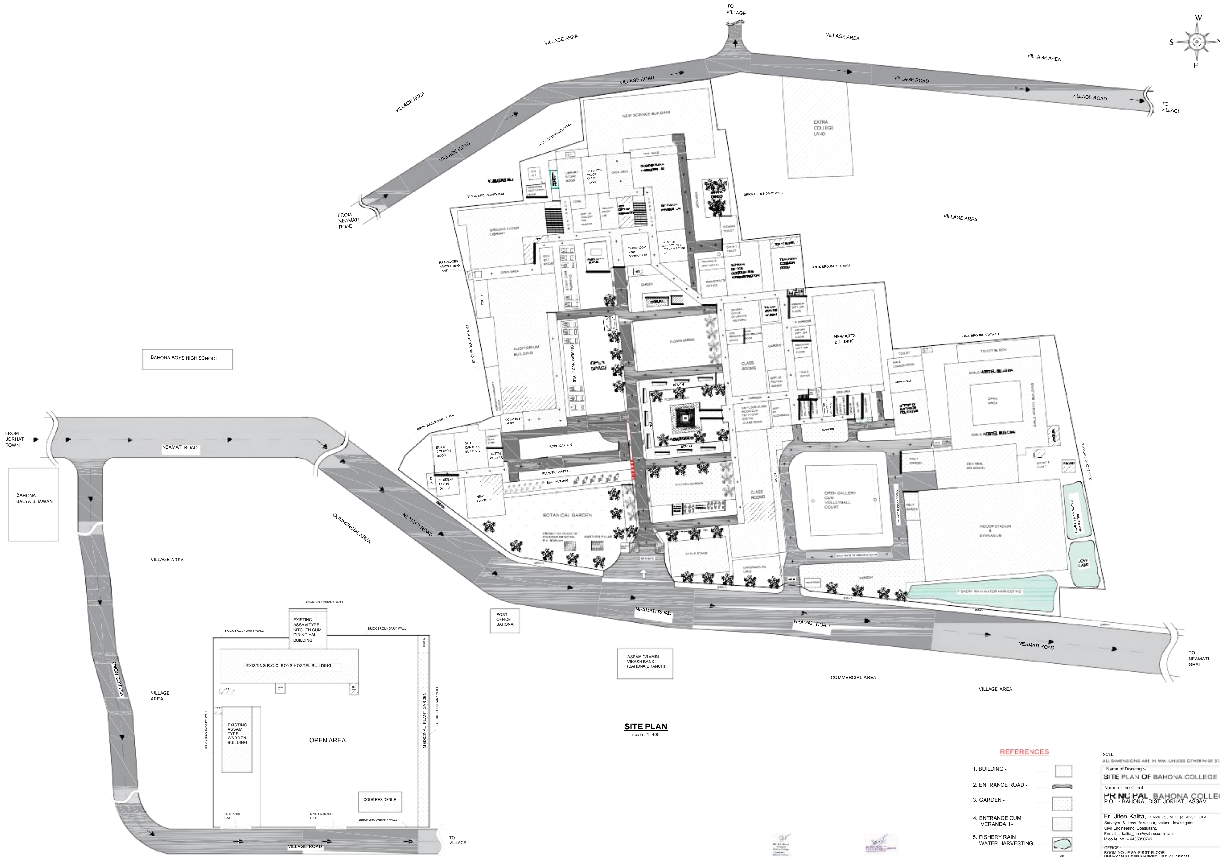
SITE PLAN scale : 1: 400