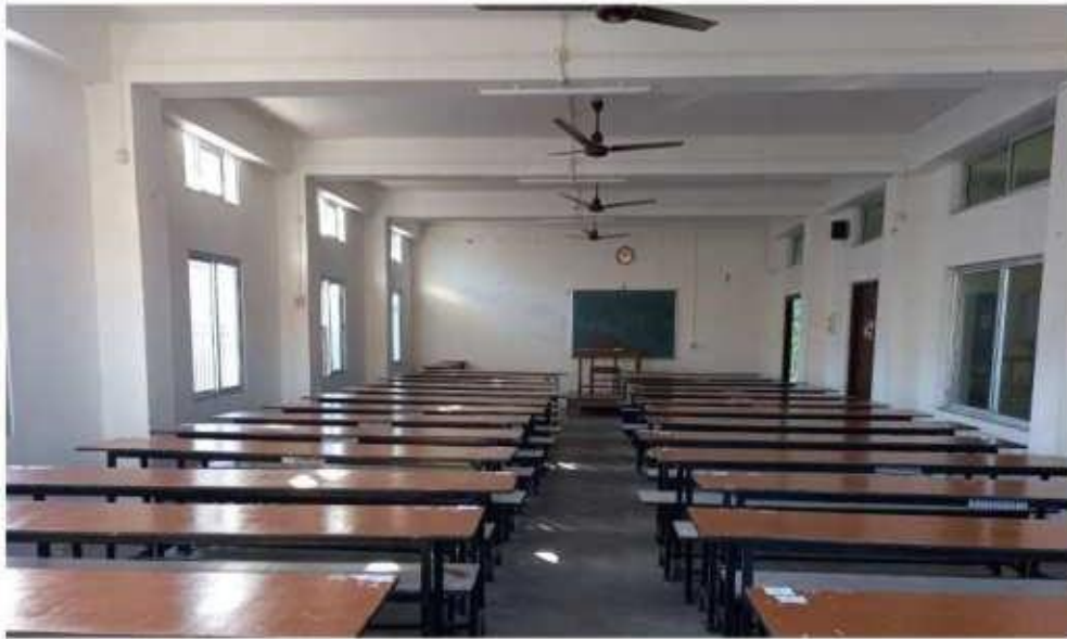
Proposed B.Ed Classroom (ITEP-5)