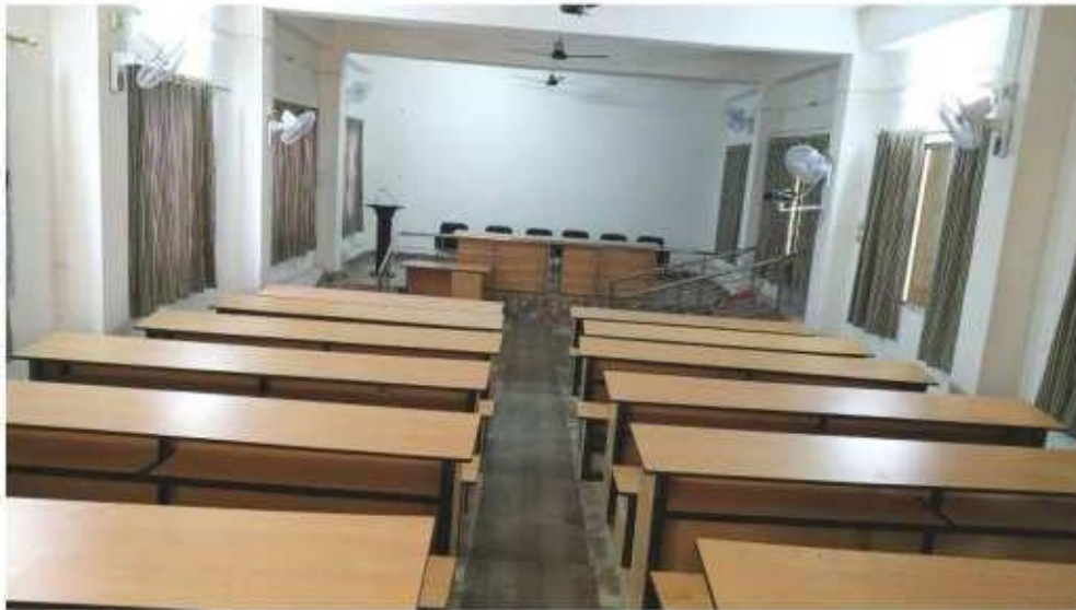
Proposed B.Ed Class Room Cum Seminar Hall (ITEP-5)