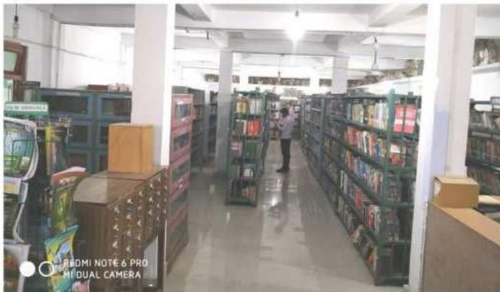
College Central Library