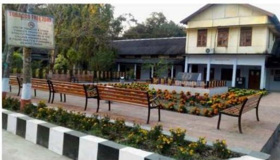
Front View of the college