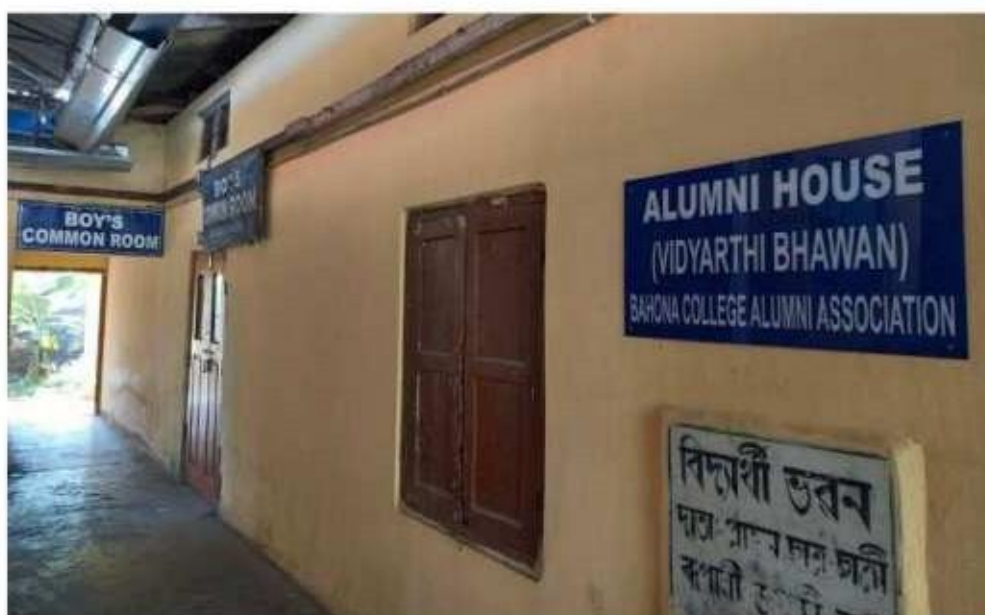
Bidyarthi Bhawan (10)