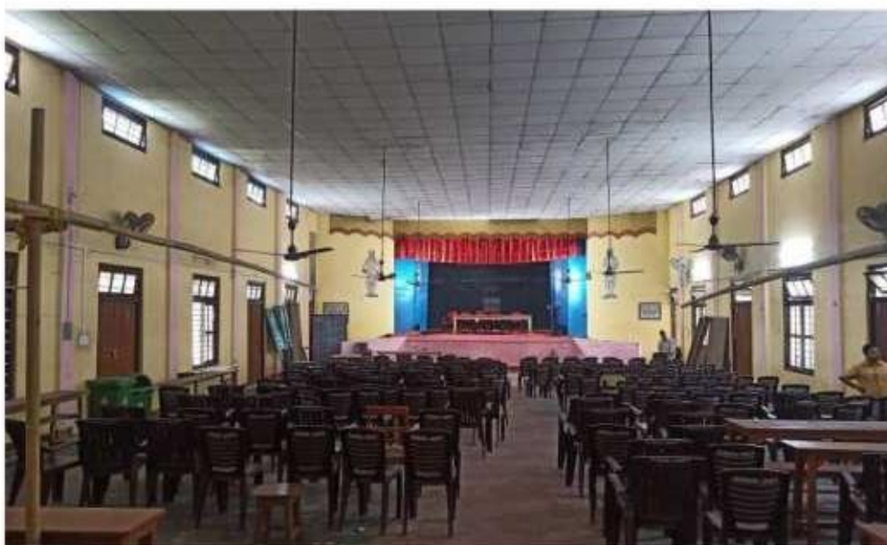
Auditorium/ Multipurpose Sitting Hall