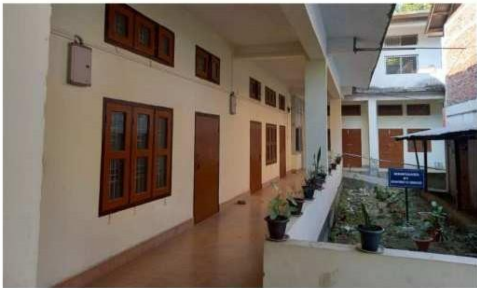
New Science Building (15)