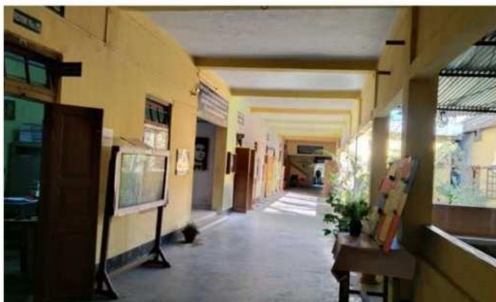
Old Arts Building Two storied (3)