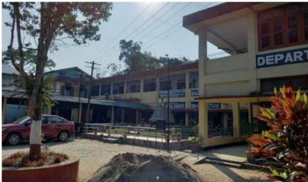
Two storied Science Building (6)