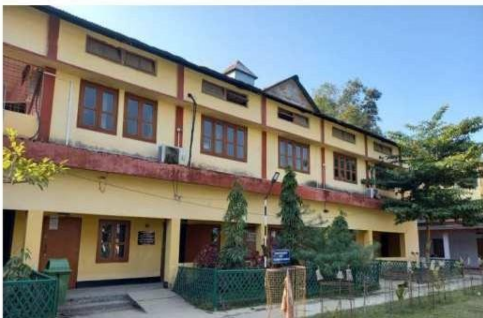
Conference Hall Two Storied (4)